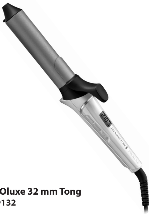
PROluxe 32 mm Tong CI9132