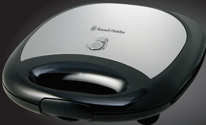
MODEL RHTSM4D Pictured